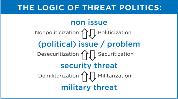
FIG. 1. The Logic of threat politics. 2)